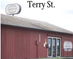
Euphoria Chocolate Company Store

Tell your friends they can pick up a Wetland Word at boxes outside the front door of the Euphoria Chocolate Company West Eugene Store, on the bike trail next to Elmira Automotive, and at Redwood Northwest, corner of West 11th Ave. and Terry St.